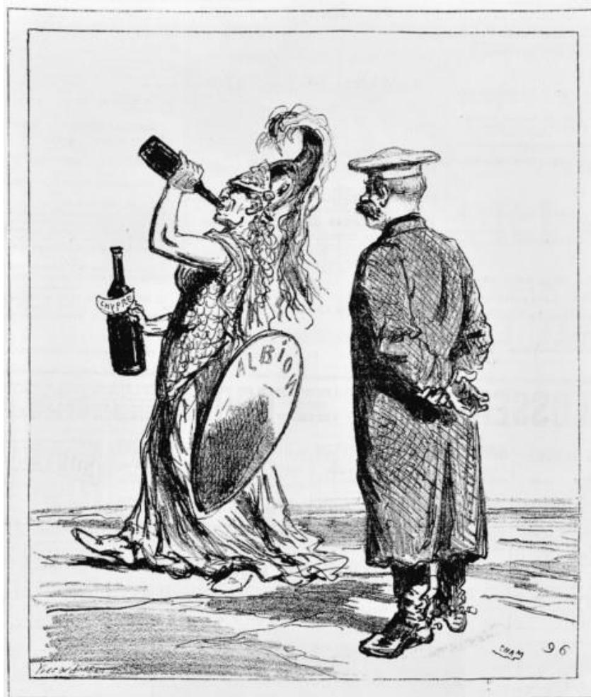
On dirait que ce vin la grise.

What does a painting tell us? What should we look for? What can we learn? How can we appreciate it the most?